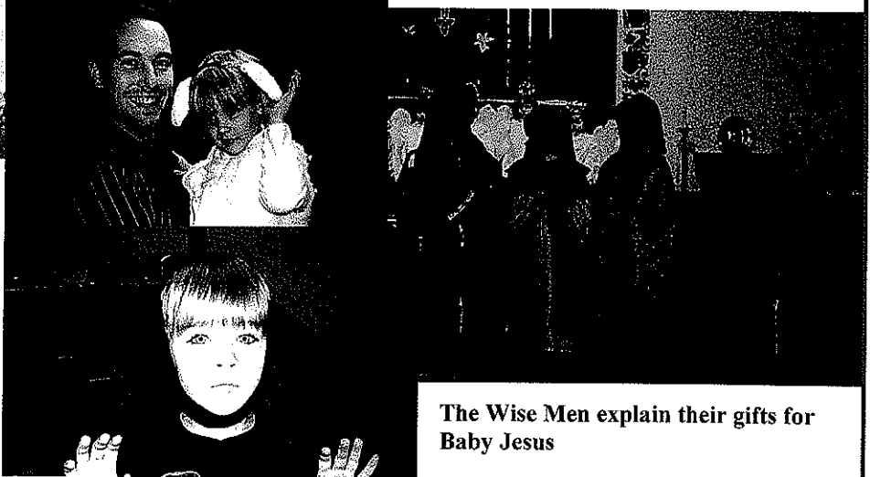
The Wise Men explain their gifts for Baby Jesus