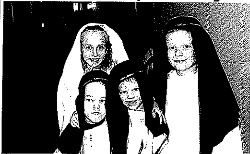
Mary and her entourage of shepherds