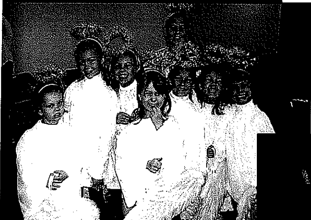
Each one a precious angel