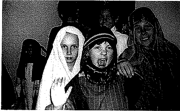
Mary, Joseph and the "good" Innkeeper